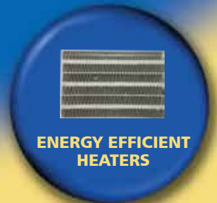
ENERGY EFFICIENT HEATERS

FACTORIES • PHARMACEUTICAL • DEFENCE INDUSTRY • SHIPS WAREHOUSES • COLD STORES • ARCHIVES • POWER STATIONS