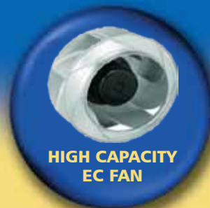
HIGH CAPACITY EC FAN